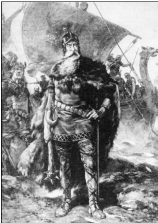
Lithograph of a Viking warrior. The Vikings terrorized Europe in the early Middle Ages.

The lack of a central government led to the development of the feudal system mentioned earlier. This feudal system grew out of people's need for protection. With no strong kings to maintain law and order, people turned to local lords for help. At the heart of the system were personal arrangements between two parties.